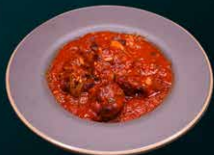
GARLIC CHICKEN Q240 H380 F660