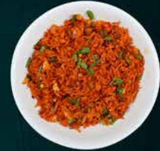
SCHEZWAN EGG ■ 190