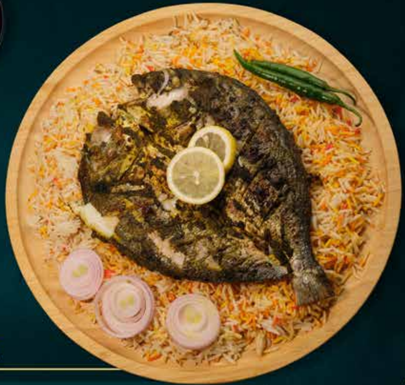
FISH MAZBI AS PER SIZE