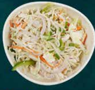
CHICKEN NOODLES ■ 210