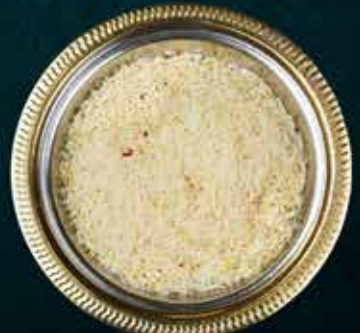
MANDI RICE Q-110 H-210 F-410