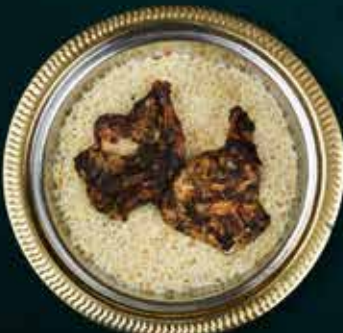
PEPPER MAZBI Q-230 H-440 F-850