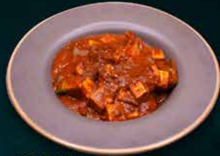
KADAI PANEER 240