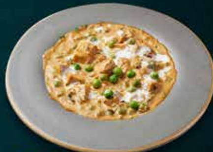
PANEER MUTTER MASALA 240