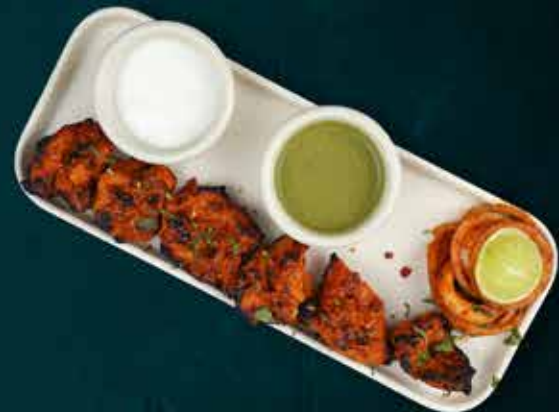
ACHARI TIKKA 6PCS 290