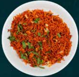
SCHEZWAN CHICKEN ■ 220