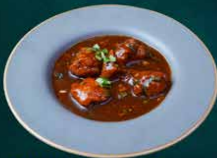
CHILLI CHICKEN Q220 H360 F660