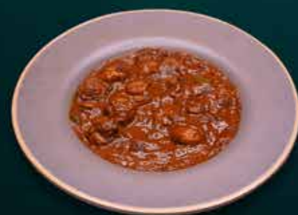
MUSHROOM PEPPER MASALA 230