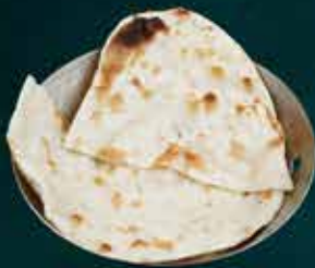
PLAIN NAAN 28