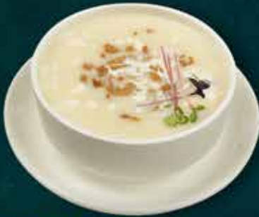
CREAM OF MUSHROOM