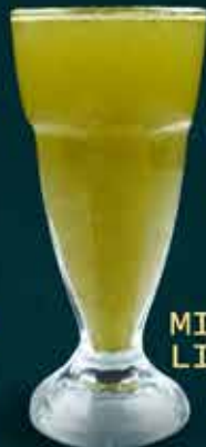
MINT LIME 35