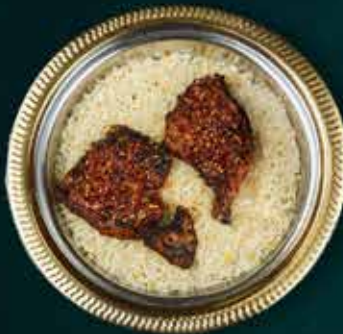
PERI PERI MAZBI Q-230 H-440 F-850