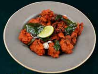
NUTTY CAULIFLOWER 230