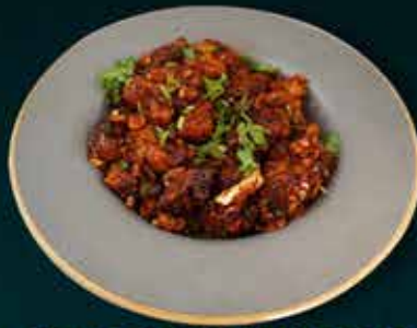
GOBI MANCHURIAN DRY 220