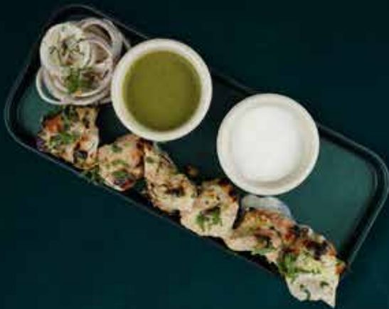
MALAI TIKKA 6PCS 290