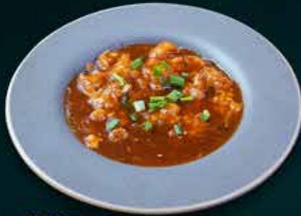
GOBI MANCHURIAN 210