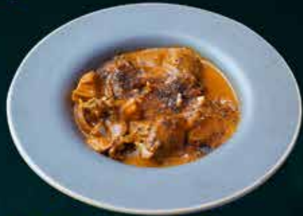
KADAI CHICKEN Q220 H380 F720