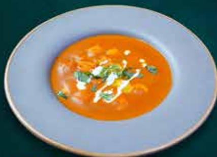
PANEER BUTTER MASALA 240