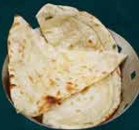
BUTTER NAAN 35