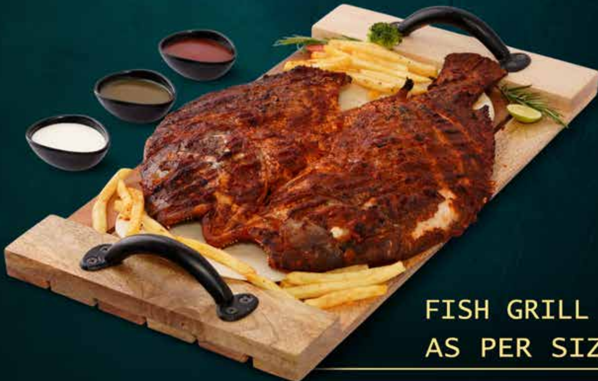
FISH GRILL AS PER SIZE