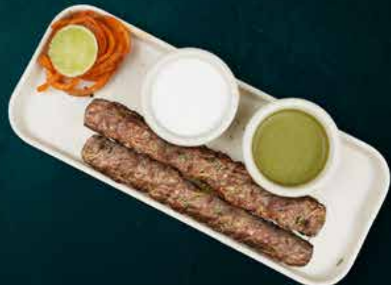
BEEF SHEEK 2STICK 240