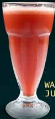
WATER MELON JUICE 75