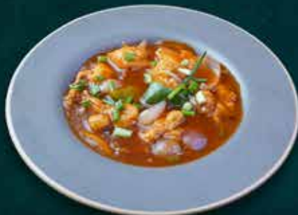
CHILLI GOBI 210