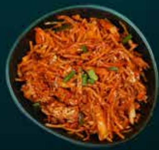
SCHEZWAN CHICKEN NOODLES ■ 230