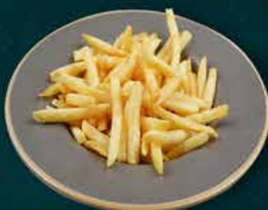
FRENCH FRIES 80