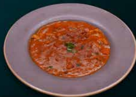
MIX VEG MASALA 140