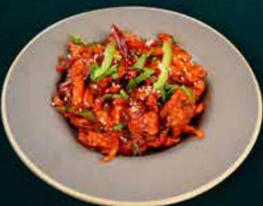
DRAGON CHICKEN 280