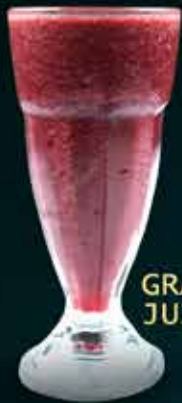
GRAPE JUICE 75