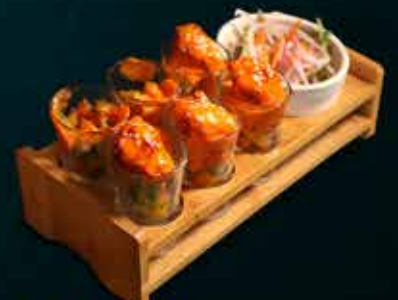
CHICKEN DYNAMITE 260