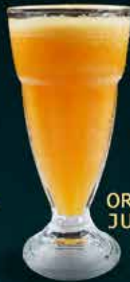
ORANGE JUICE 90