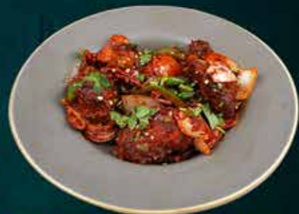
CHICKEN KONDATTAM Q210 H360 F690