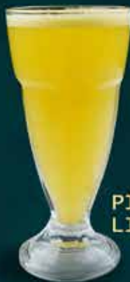
PINEAPPLE LIME 60