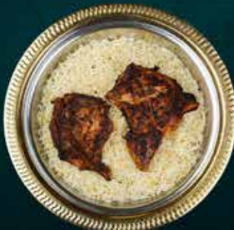
REGULAR MAZBI Q-210 H-400 F-780