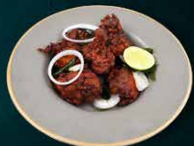
CHICKEN 8PCS 15PCS 65 180 330