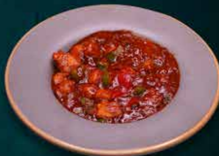
CHILLI PANEER 220