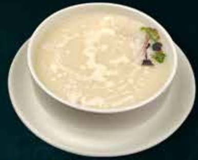
CREAM OF CHICKEN