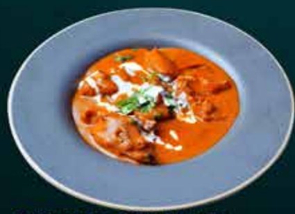
BUTTER CHICKEN Q250 H420 F780