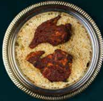
GOCHU GRILL MAZBI Q-240 H-460 F-890