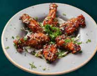
HONEY CHICKEN WINGS 240