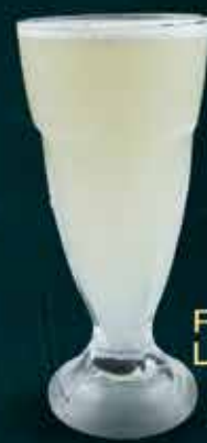
FRESH LIME 25