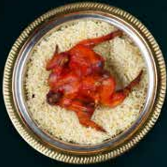
CHICKEN MANDI Q-180 H-360 F-700