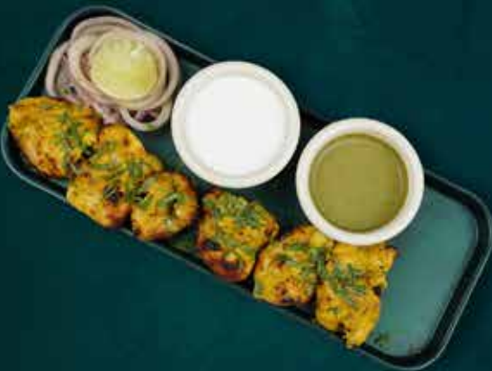
RESHMI TIKKA 6PCS 290