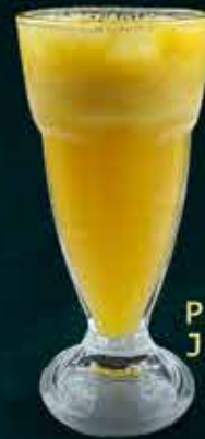
PINEAPPLE JUICE 80