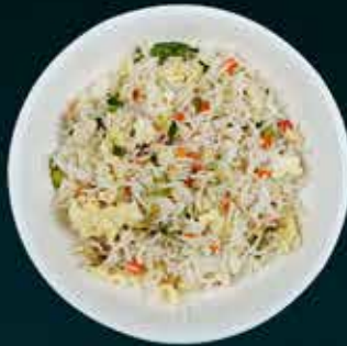
CHICKEN FRIED RICE ■ 190