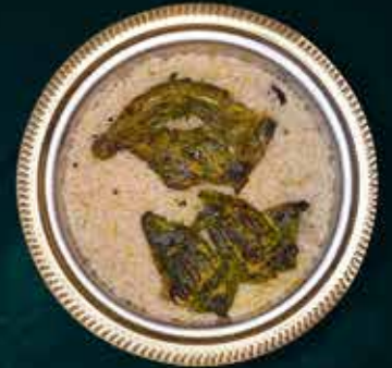
FILFIL MAJLIS MAZBI Q-240 H-460 F-890