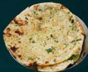
GARLIC NAAN 45