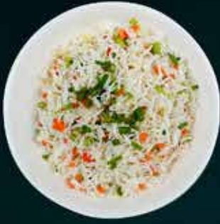
VEG FRIED RICE ■ 160