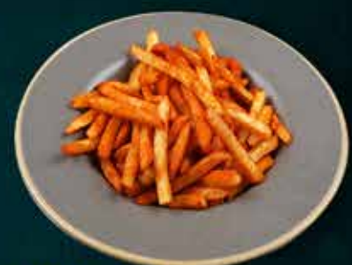
PERI PERI FRIES 90