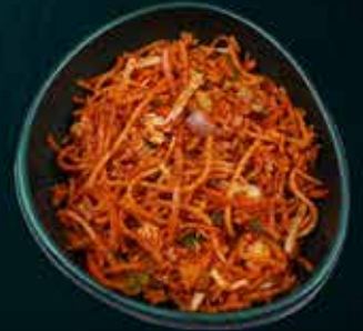
SCHEZWAN EGG NOODLES ■ 190