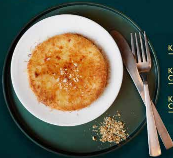
KUNAFI CHEESE 295