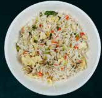
EGG FRIED RICE ■ 170