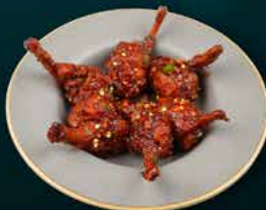
HONEY CHICKEN LOLLIPOP 260