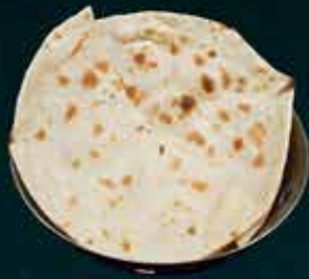
TANDOORI ROTI 24