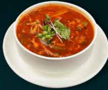
HOT N SOUR