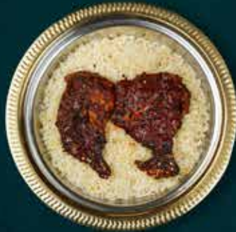
HONEY MAZBI Q-235 H-460 F-870