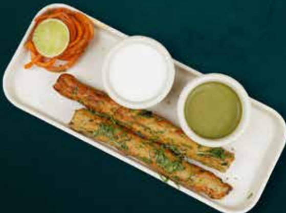
CHICKEN SHEEK 2STICK 240