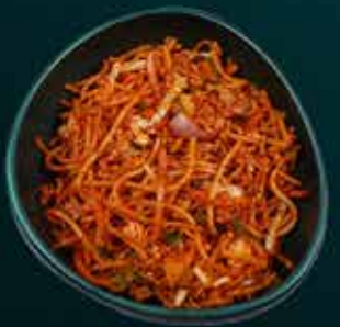
SCHEZWAN VEG NOODLES ■ 180