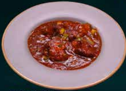
CHICKEN MANCHURIAN 220