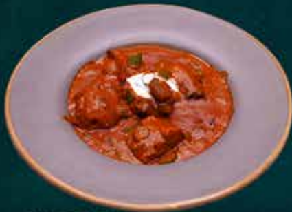
CHICKEN TIKKA MASALA 280