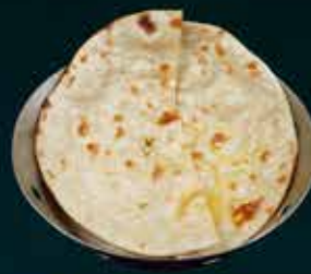
BUTTER ROTI 33