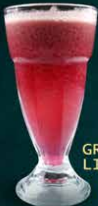
GRAPE LIME 60