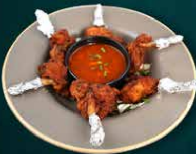
CHICKEN LOLLIPOP 6 PCS 240