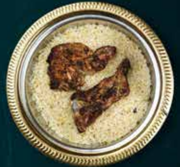
AFGHANI MAZBI Q-230 H-440 F-850