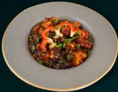
PANEER MANCHURIAN DRY 250