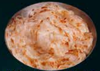
KERALA PAROTTA 18 WHEAT PAROTTA 22