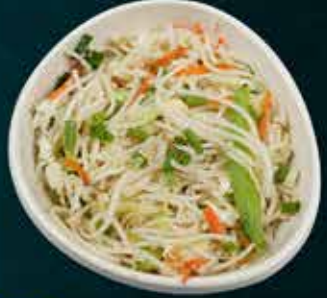
EGG NOODLES ■ 170