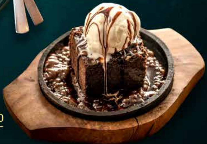
SIZZLING BROWNIE 160