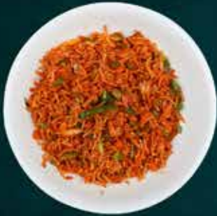
SCHEZWAN VEG ■ 180