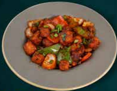
CHILLI PANEER DRY 250