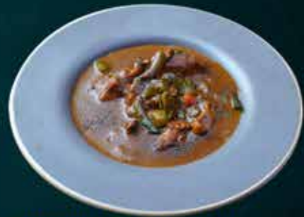
PEPPER CHICKEN Q210 H360 F690