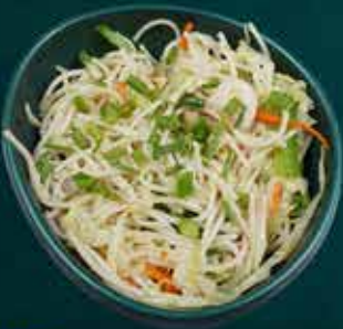
VEG NOODLES ■ 160