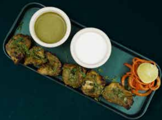
HARIYALI TIKKA 6PCS 290